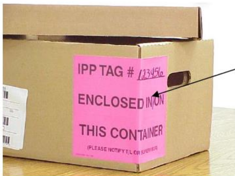
Labels wrapped around corner