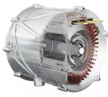
Impressive: Innovative cooling prevents overheating – even during continuous operation with 90 percent of the motors peak performance.