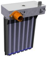
The new PTC heater from MAHLE is compact, lightweight, and low-cost.

PTC heaters from MAHLE are already fitted in many vehicles worldwide today. With this further development, MAHLE is now specifically focusing on the growing fleet of electric vehicles. The company also offers complete systems, which, with the combination of a heat pump and an electric auxiliary heater, provide the maximum possible comfort together with a high cruising range.